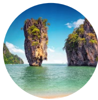
DAY 7 Phuket