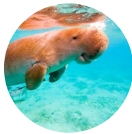
DAY 4 Koh Libong