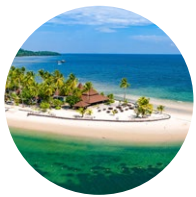
DAY 5 Koh Muk Koh Lonta Bay