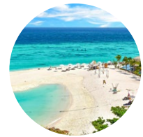
DAYS 1&2 Koh Lipe