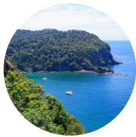
DAY 3 Koh Rok Noi