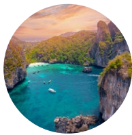
DAY 6 Maya Bay Koh Phi Phi